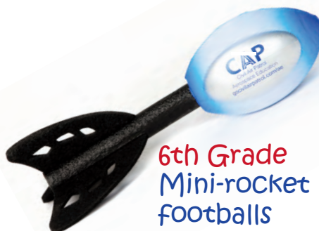
6th Grade Mini-rocket footballs