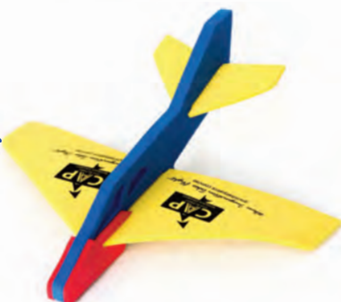
3rd Grade Foam gliders