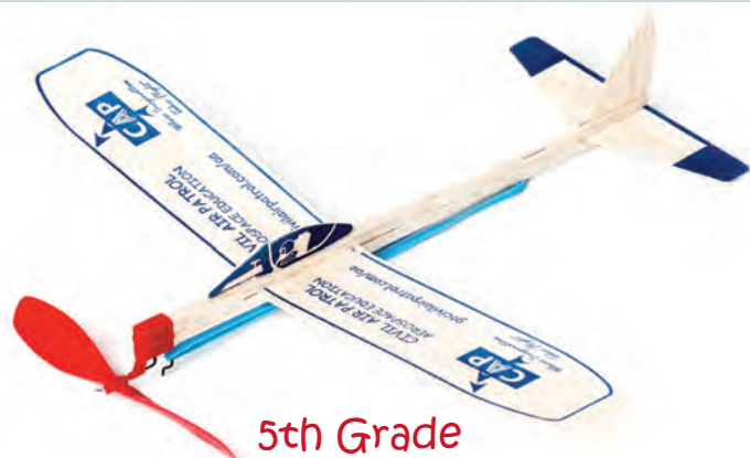
5th Grade Balsa planes (powered by rubber bands)