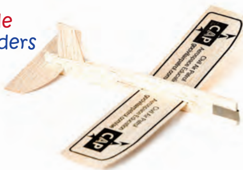
1st Grade Balsa gliders