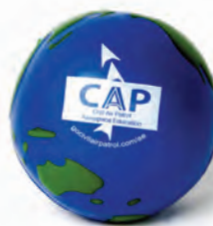
Kindergarten Earth balls

Each ACE teacher receives a free class set of grade-specific aerospace educational items. Each ACE student gets one of these fun and engaging items to bring the study of space and flight to life!