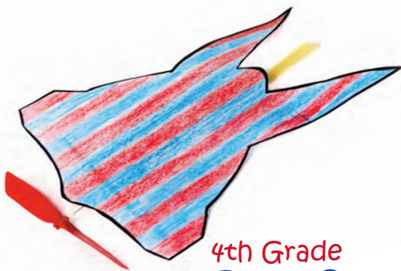
4th Grade Rocket Planez™