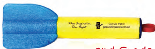
2nd Grade Finger rockets